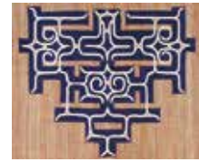
© Rumiko Fujitani, 2013. Traditional Ainu pattern for Attus clothing.

Today, Hokkaido has a population of 5.3 million people, but the region was only fully incorporated into Japan in the mid-nineteenth century. Hokkaido is the home of the indigenous Ainu people. As a place where various cultures meet, Hokkaido is an ideal location to consider issues of cultural diversity and multiculturalism in Japan, Asia and beyond.