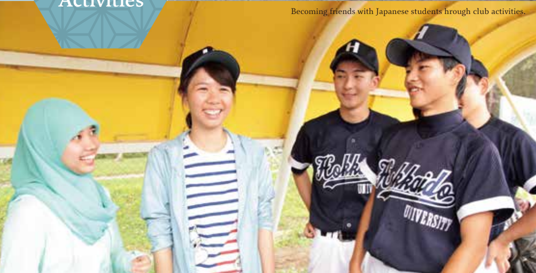
Becoming friends with Japanese students through club activities.

With over 250 university clubs and societies to join, there will be something to suit everyone's interest. Join one of the teams that dances in the Yosakoi Soran Festival, play in the university orchestra, go skiing in Niseko or learn a Japanese martial art. You will find that joining a club is a fascinating insight into Japanese life and culture, as well as a great place to make Japanese friends.