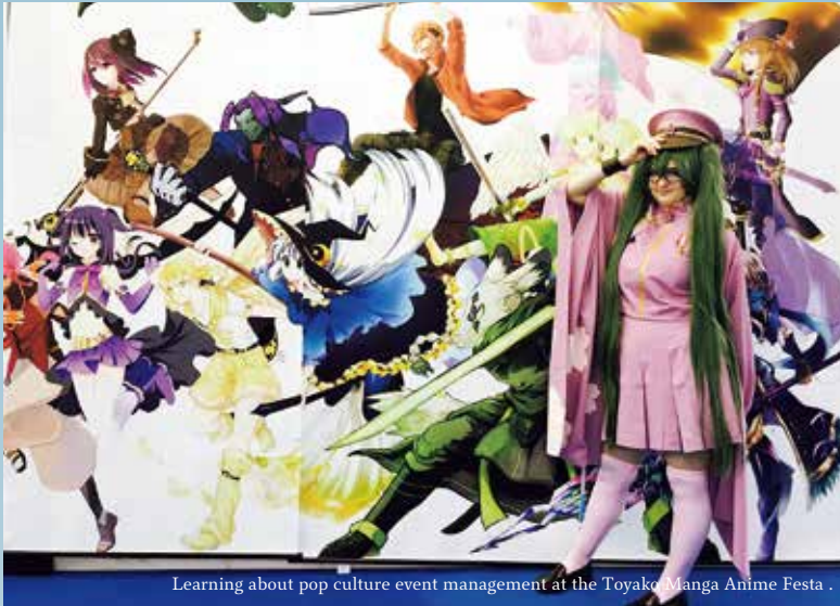
Learning about pop culture event management at the Toyoko Manga Anime Festa.