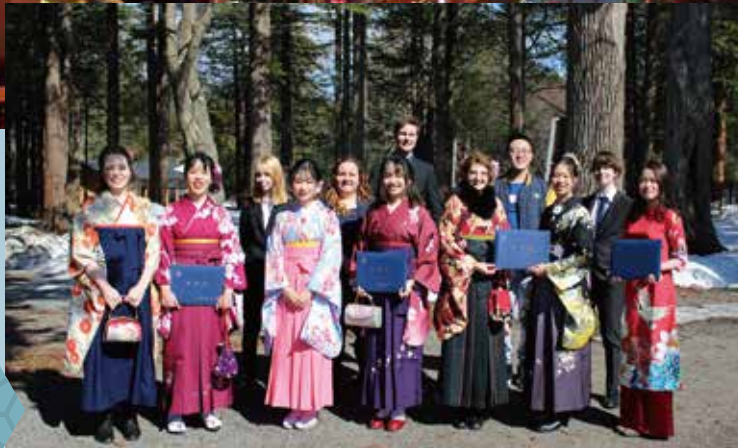
Graduation Picture of Class of 2020