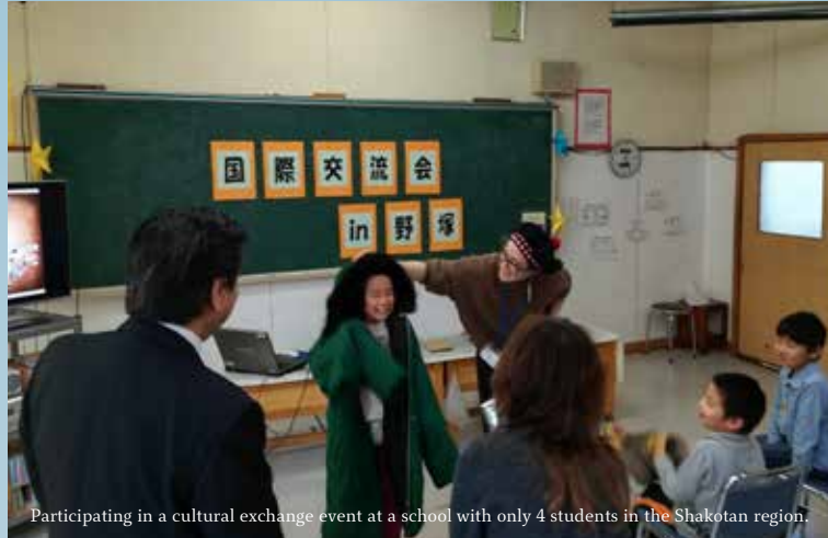
Participating in a cultural exchange event at a school with only 4 students in the Shakotan region.