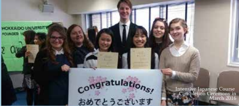
Intensive Japanese Course Completion Ceremony in March 2016