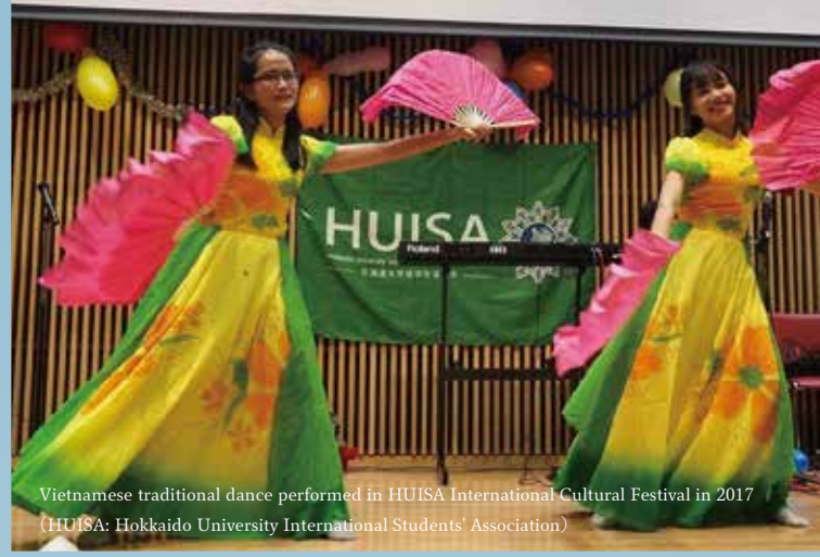
Vietnamese traditional dance performed in HUISA International Cultural Festival in 2017 (HUISA: Hokkaido University International Students' Association)